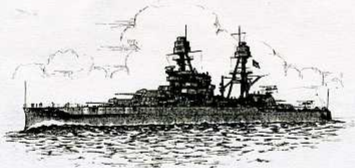
U. S. S. ARIZONA