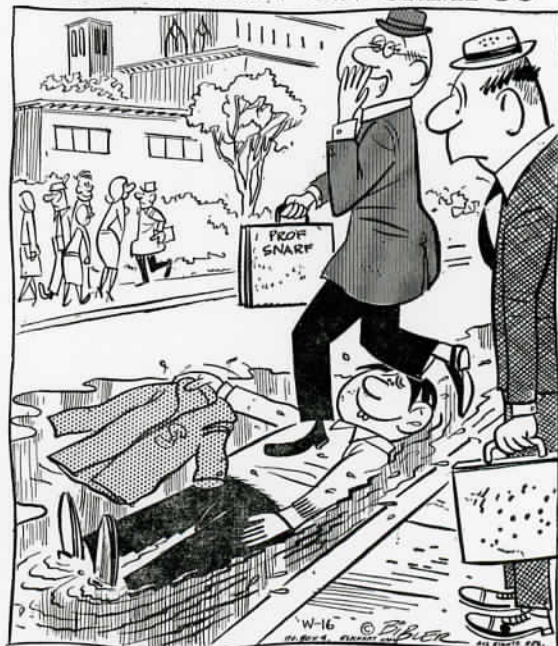
"WHEN MY STUDENTS EXTEND THESE EXTRA LITTLE COURTESIES YOU CAN BET WE'RE GETTING PRETTY CLOSE TO FINALS."