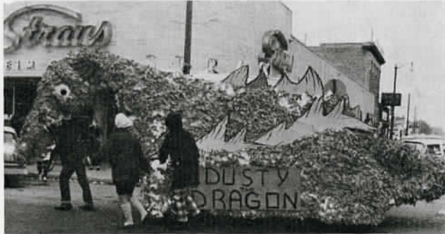
Problem in beauty? (Philo float — vintage 1959)

Napkins, napkins and more napkins! How many more will I be able to stuff in holes in chicken wire. The poor little napkin is a rather non-talked about article until Homecoming arrives; and then it becomes a much used, much talked about, and much cursed article.