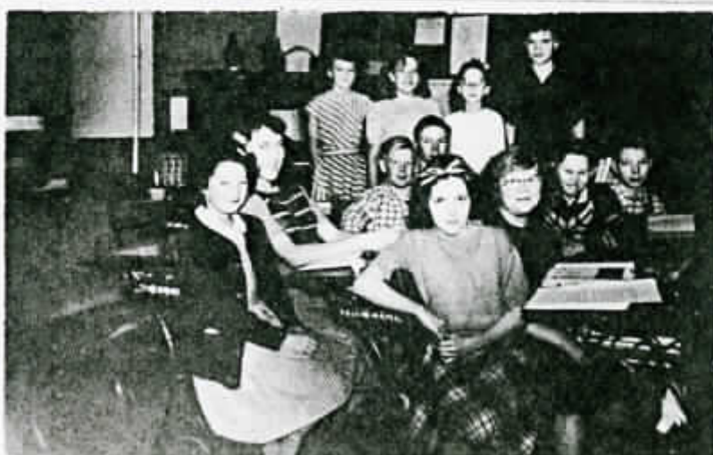
Y. C. L.