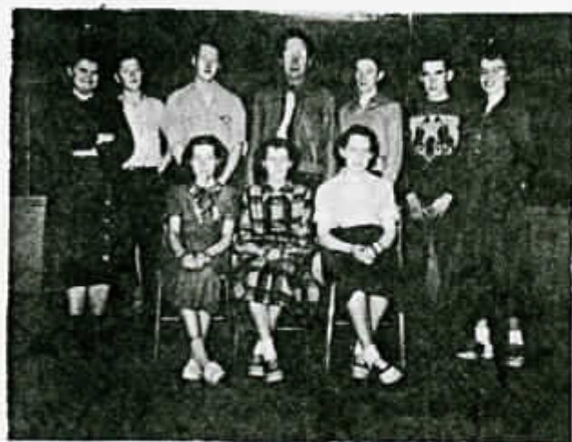
"A PAIR OF COUNTRY KIDS"