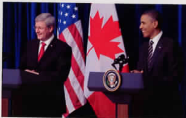
Prime Minister Stephen Harper and President Barack Obama announce action plans for perimeter security and economic competitiveness and regulatory cooperation.

On December 7, 2011, Prime Minister Harper and President Obama announced two action plans designed to accelerate the legitimate flows of trade and travel, improve security in North America and align regulatory approaches between Canada and the United States.