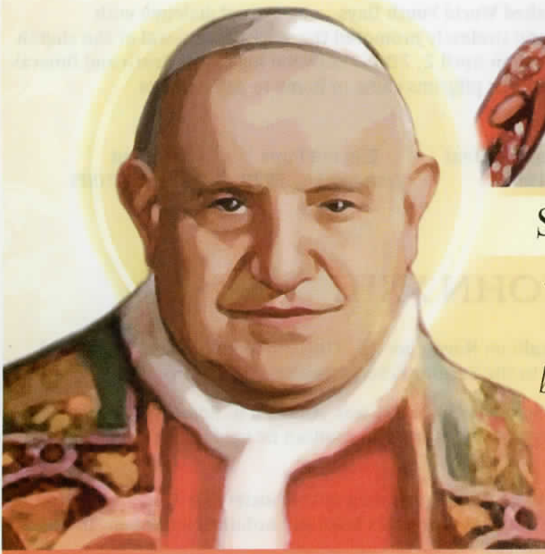
SAINT JOHN XXIII

"Peace is but an empty word, if it does not rest upon that order...that is founded on truth, built up on justice, nurtured and animated by charity, and brought into effect under the auspices of freedom...human resources alone, even though inspired by the most praiseworthy good will, cannot hope to achieve it. God Himself must come to man's aid with His heavenly assistance." — Pacem in Terris