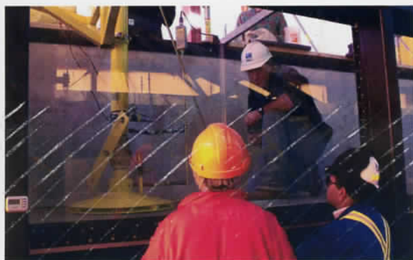
Barr worked with its Dutch partner, Deltares, in Alberta, Canada to design, build, and operate a 25-meter flume to evaluate oil-sands tailings deposition methods and post-processing-tailings-treatment options

The company relies on a seamless U.S.–Canadian border to maintain its operations and competitive edge. The company's three highly integrated plants typically supply each other with 11 southbound and six northbound trailers daily, almost exclusively at the Pembina border crossing between Manitoba and North Dakota. 🍁