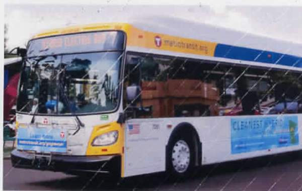
Next-generation hybrid electric bus manufactured by New Flyer in St. Cloud, Minnesota

174,200 jobs in Minnesota depend on trade & investment with Canada